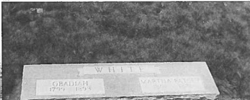
Guffey - Shell Cemetery Spring Creek, McMinn Co. Tenn